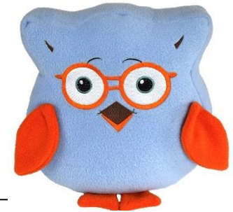
Bertie the Owl

Special People Introduce Bertie the Owl. Religions: Quaker, Christianity and Judaism.